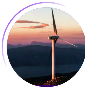
Energy, Utilities & Resources